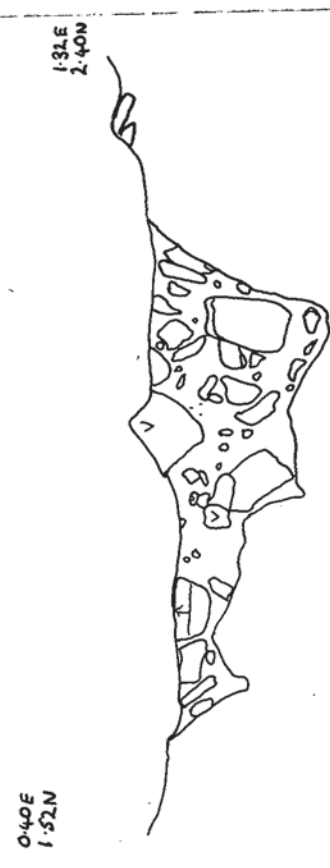
FEATURE PLAN F7061 Scale 1:10