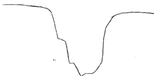
EAST - WEST PROFILE OF F6377